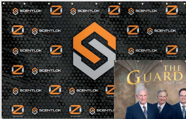
10' x 16'