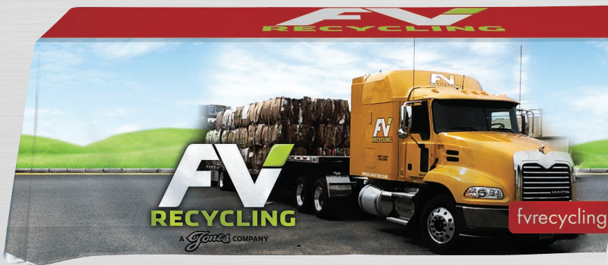
2' x 8'