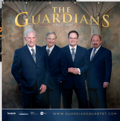
10' x 10'