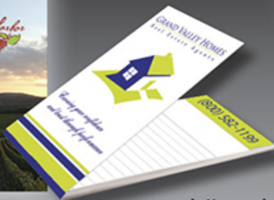
Jotter or Journal - Full Color Full Coverage on front & back w/30 sheet perforated pad