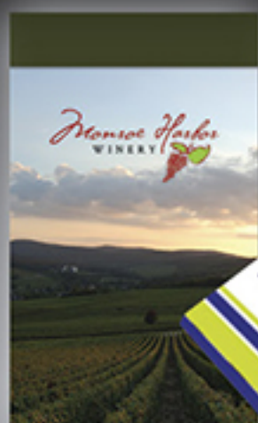
FP35 - 3" x 5" Jotter