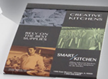
FP57 - 5" x 7 3/4" Journal