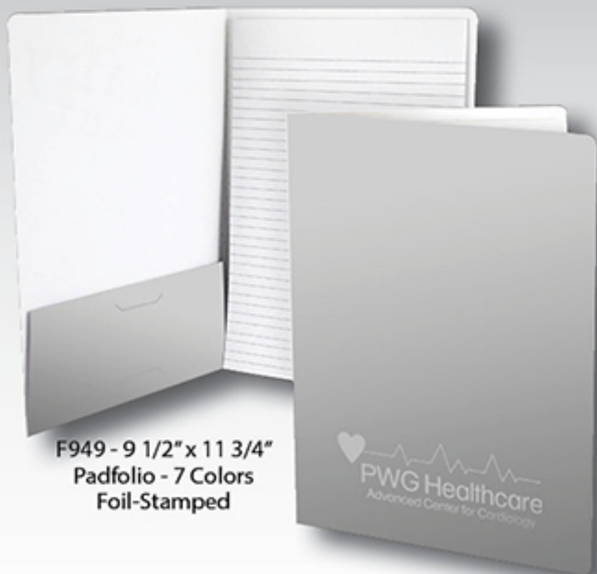
F949 - 9 1/2" x 11 3/4" Padfolio - 7 Colors Foil-Stamped