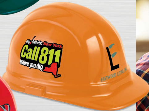
2-Sided & Front Imprint