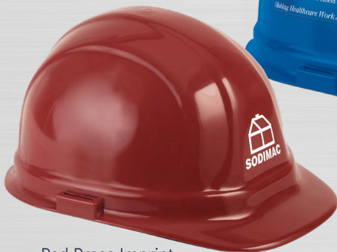
Pad Press Imprint