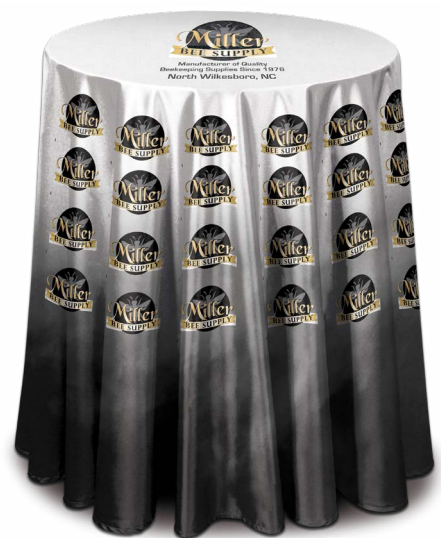
ROUND TABLE THROW