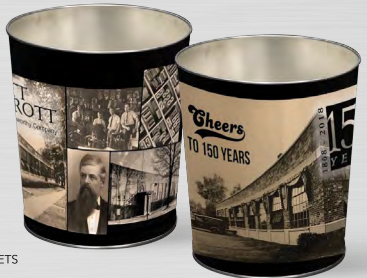
11.5" SMALL WASTEBASKETS