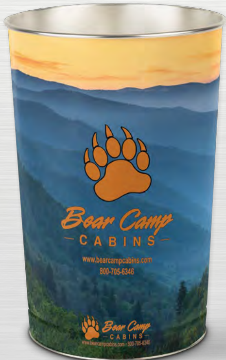
15" LARGE WASTEBASKET