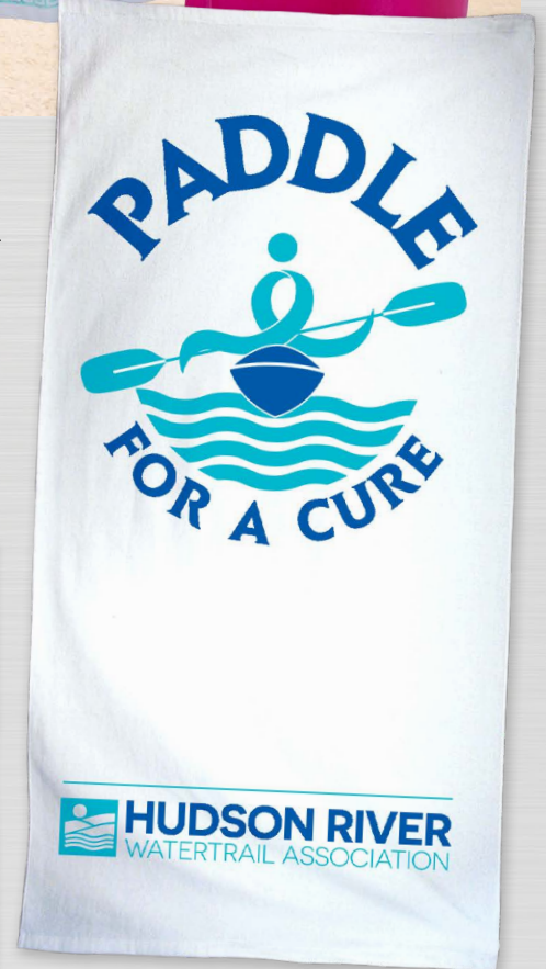
WHITE BEACH TOWEL SCREENED IMPRINT