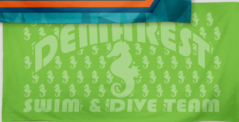
COLORED BEACH TOWEL - CLEARANCE!