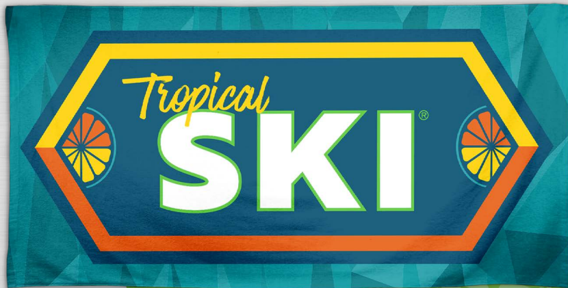
FULL COLOR BEACH TOWEL