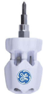
Item # 0611WH