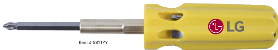
Item # 8811PY

Until Monday, October 14, receive FREE printing and FREE set-up on all orders. This includes a four-colour process print valued at $0.25 per unit plus you'll save the $70 set-up fee.