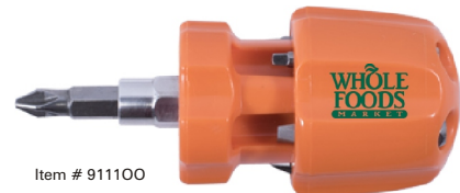
Item # 911100

All Picquic products are made in Canada and distributed exclusively through authorized advertising specialty distributors. Prices in US dollars. (3CD2E). Applicable taxes extra. Promotional offer and pricing available through 10/14/19.